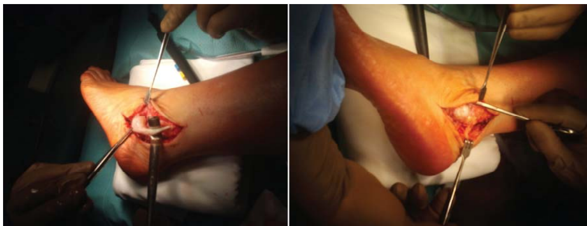
Fig. 2 – Peroneus brevis ganglion in surgery.