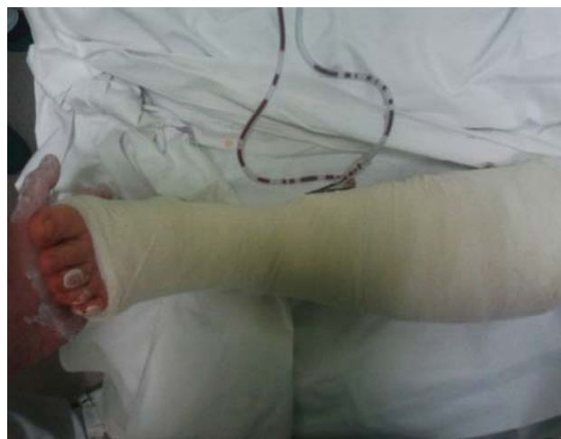
Fig. 5 – Below-knee non weight bearing cast in 5 degree eversion and neutral position.

Peroneal tendon pathology is common but rarely mentioned in the literature. Reports found in the literature are all from a distant history, no new cases have been described 1-12 . Therefore we presented a case where we reconstructed a retinaculum as well as the defect of peroneus brevis tendon after excision of the ganglion cyst with semitendinosus graft.