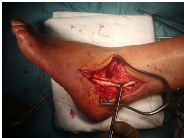
Fig. 3 – Reconstruction of peroneus brevis tendon defect and superior peroneal retinaculum with semitendinosus graft.

graft to the remainder of retinaculum (Figure 4). At operation, peroneal sulcus appeared too shallow and it was deepened to avoid reoccurrence of the peroneal tendon luxation. Histology confirmed the intratendinous ganglion cyst.