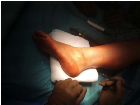
Fig. 1 – Left ankle with lateral edema.

A 38-year-old female was examined at the emergency department where she reported a crack and later pain in the lateral side of the ankle during walking. Ankle sprain was diagnosed and functional treatment was advised. After one month she complained of increasing pain and edema on the lateral side of the ankle. Clinical examination revealed edema at the lateral side, inversion position of the foot with painful palpation, especially on the anterior talofibular ligament and fibular malleolus from the lateral and posterior side with palpable formation retromalleolarly, in the course of peroneus brevis tendon (Figure 1). X and ultrasound revealed no pathology. Clinical diagnosis of luxative peroneal tendons with superior peroneal retinaculum rupture was established. MRI was performed to confirm the clinical diagnosis and showed tendinosis of peroneal tendons with severe synovitis, intratendinous ganglion cyst of the peroneus brevis tendon and rupture of the superior peroneal retinaculum . Due to clinical findings and MRI results, the surgical treatment decision was made. Adhesiolysis was performed followed by reconstruction of peroneus brevis tendon defect and superior peroneal retinaculum with semitendinosus graft (Figures 2 and 3) that was proximally fixated by anchor suturing the